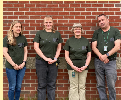
2nd Place winners of the Come Alive Outside Walking challenge! Go Bear Paws!